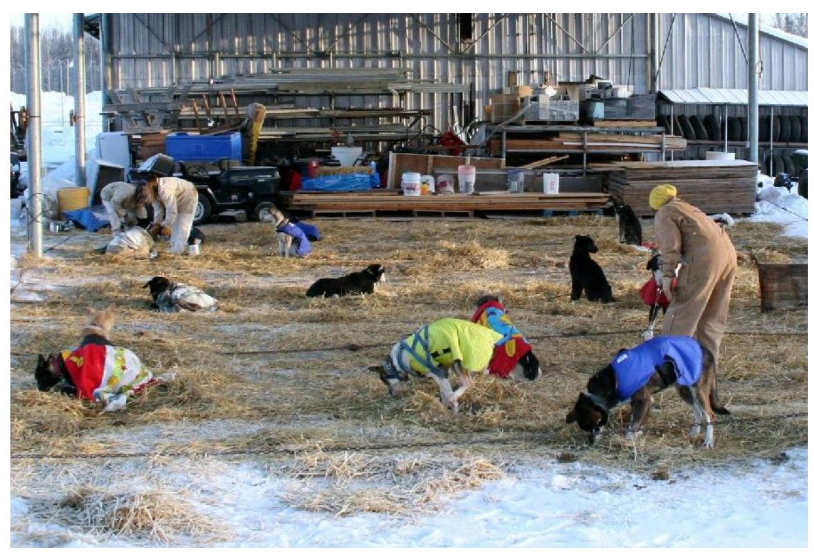
Female inmates at Hiland Mountain Correction Center caring for Iditarod dogs that had been dropped during the race.